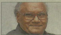
C N R Rao

"IITs need more money, if IIT-Roorkee needs to be like MIT, it needs more money. I would like our Prime Minister and government to take interest in the working of the department. So many directors posts are vacant, large number