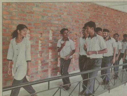
Students at National Institute of Speech and Hearing

Now, NISH offers a variety of courses including preschool training, parent guidance courses, audiological rehabilitation