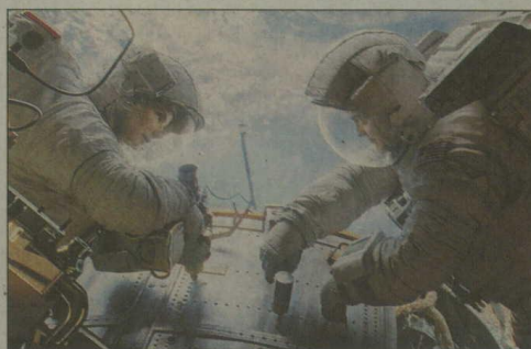
NOT JUST ART: A scene from the 2013 space thriller 'Gravity'

physics "underpin the increases in A-level entries and university applications", she said.